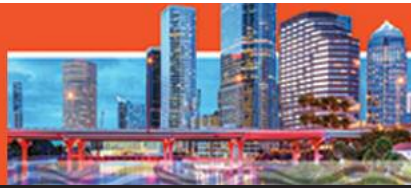
Exhibit Dates: November 5-7, 2024