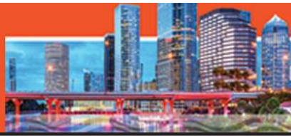
Exhibit Dates: November 5-7, 2024