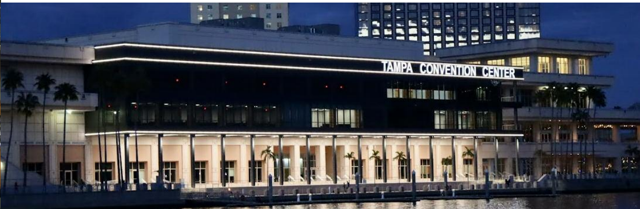
Tampa Convention Center • Tampa, Florida