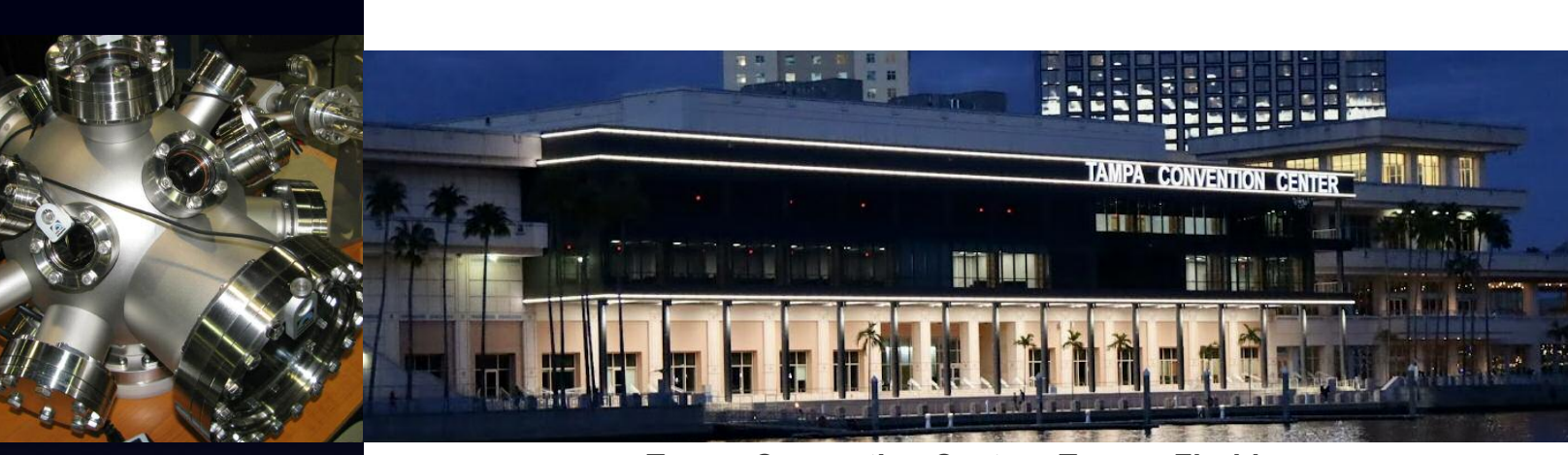
Tampa Convention Center • Tampa, Florida

AVS welcomes you to exhibit at the 70th International Symposium & Exhibition November 5-7 at the Tampa Convention Center in Tampa, Florida USA